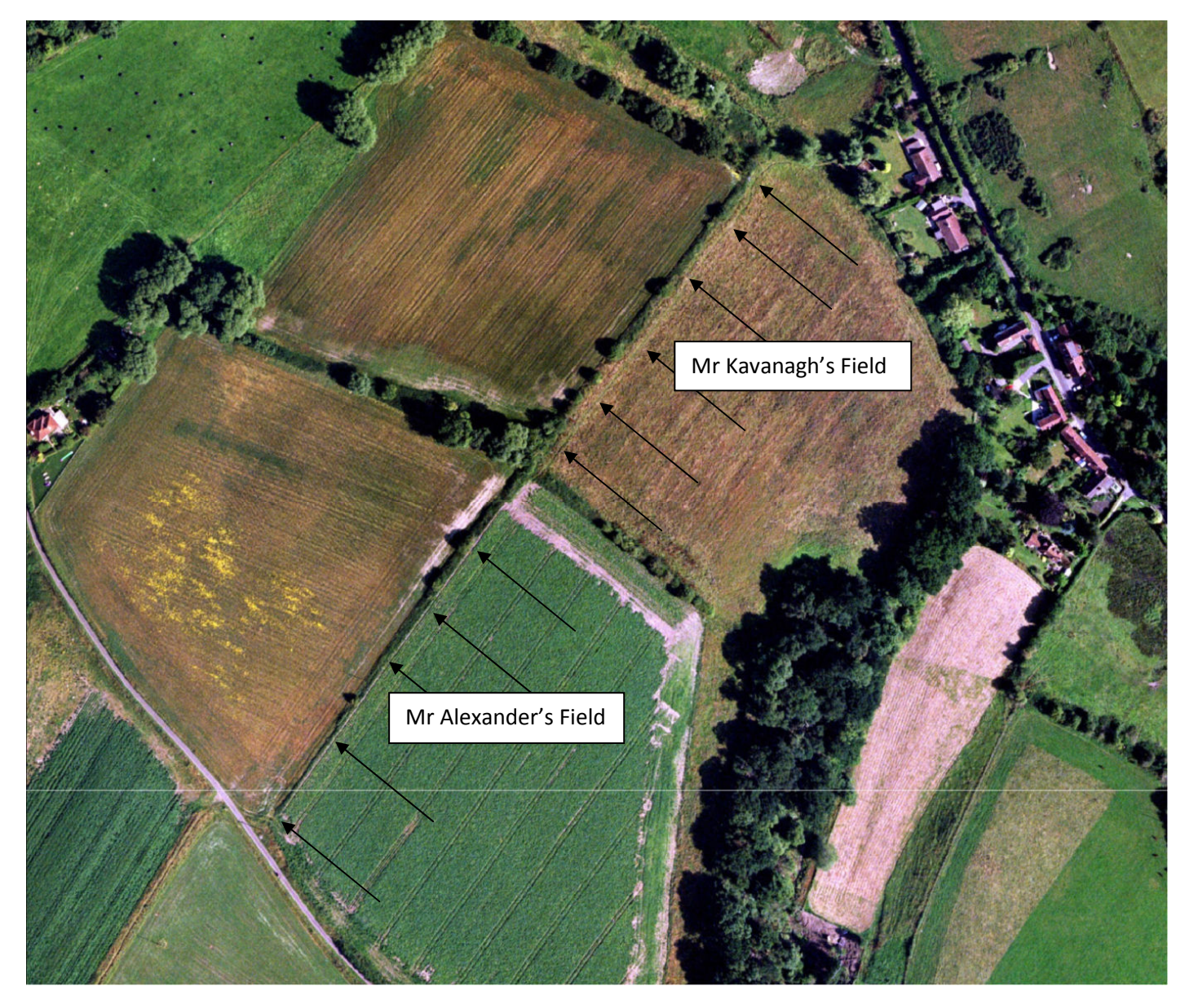
PHOTOGRAPH 1 CLAIMED ROUTE TAKEN IN 2001