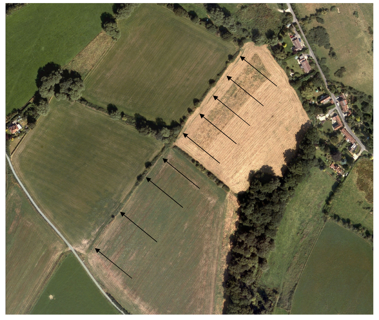
PHOTOGRAPH 6 CLAIMED ROUTE IN 2005

2005 Aerial Photograph from Wiltshire Council Mapping Layer on Map Explorer™ (not to scale) black arrows point to claimed route.